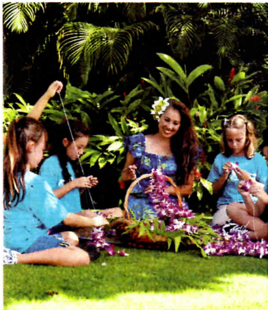
From top: Boston Harbor Hotel; Hilton Hawaiian Village Beach Resort & Spa.